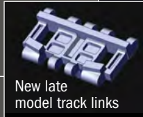
New late model track links