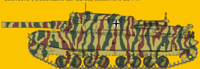
B. Wehrmacht, unknown unit, central Italy, Summer 1944.