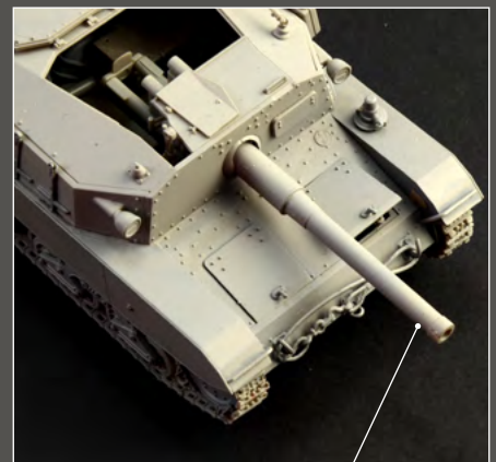
New gun: plastic and metal barrel