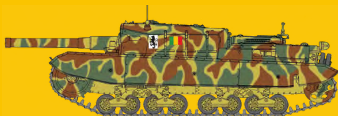
A. Repubblica Sociale Italiana, Gruppo Corazzato "Leoncello", Desenzano sul Garda, settembre 1944.