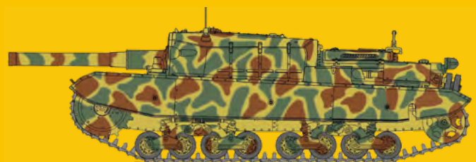
D. Regio Esercito, Ansaldo factory, Spring 1943.